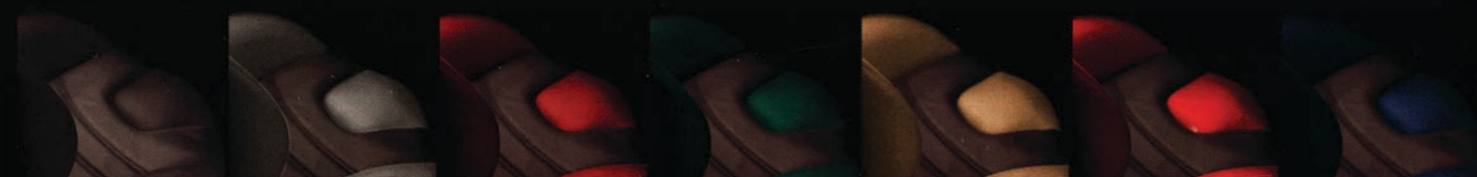
Black Dark Gray Imola Red Evergreen Dark Beige Kyalami Orange Estoril Blue

Uninhibited, uncompromising, and driven to extremes.